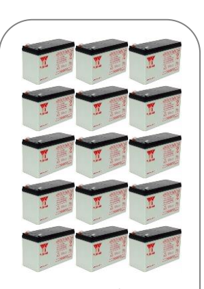
15x Yuasa 12V/9Ah batteries inside Datasheet: <u>Link</u> CSB or Panasonic brand can also be used